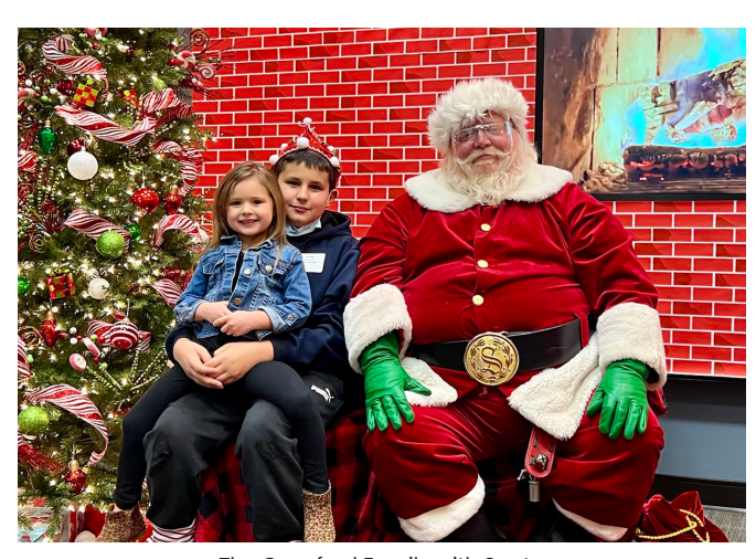
The Crawford Family with Santa