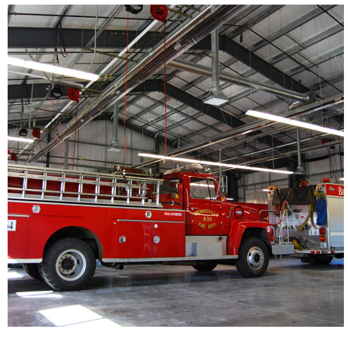
Station #61 - Pre-Engineered Metal Apparatus Bay