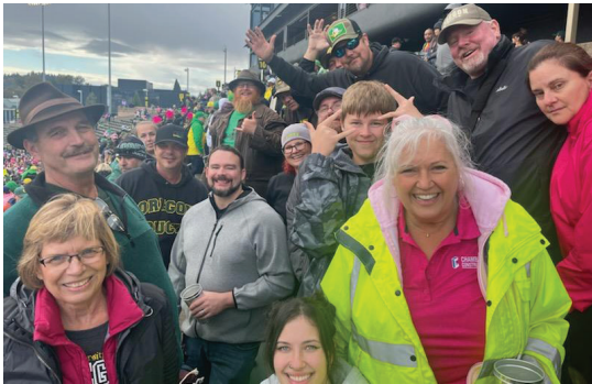
Our crew that stuck out the rain!