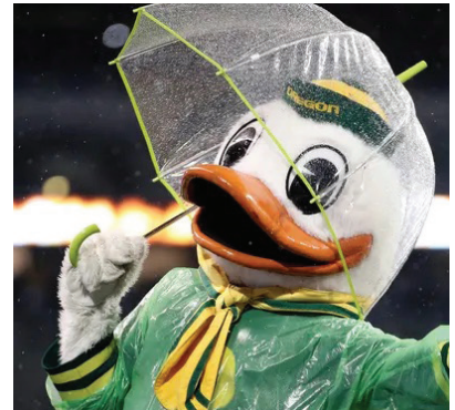
The Duck reminding you that "it never rains in Autzen Stadium"